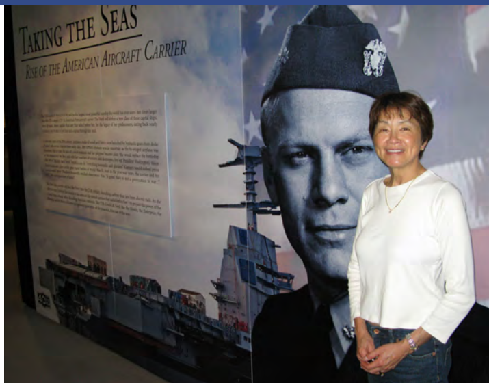
Gerald R. Ford Presidential Museum