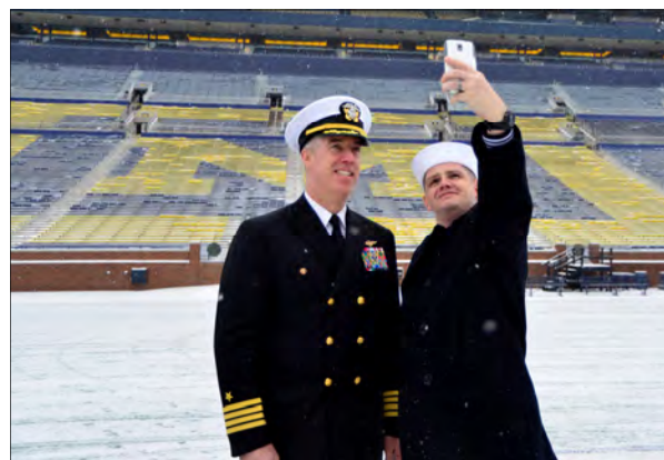
Gerald R. Ford Presidential Library