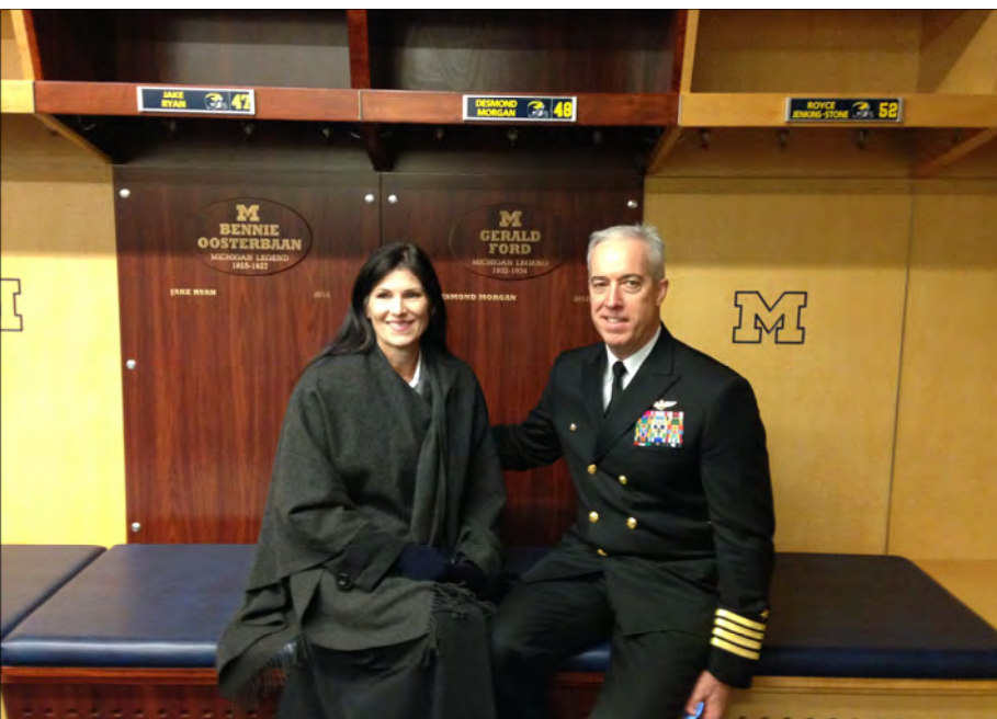
Gerald R. Ford Presidential Library