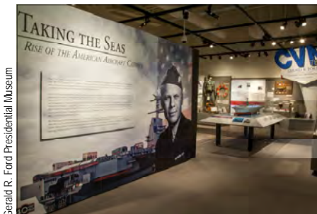
Gerald R. Ford Presidential Museum

For Additional Event Information Please Visit Our Website or Call 616-254-0396.