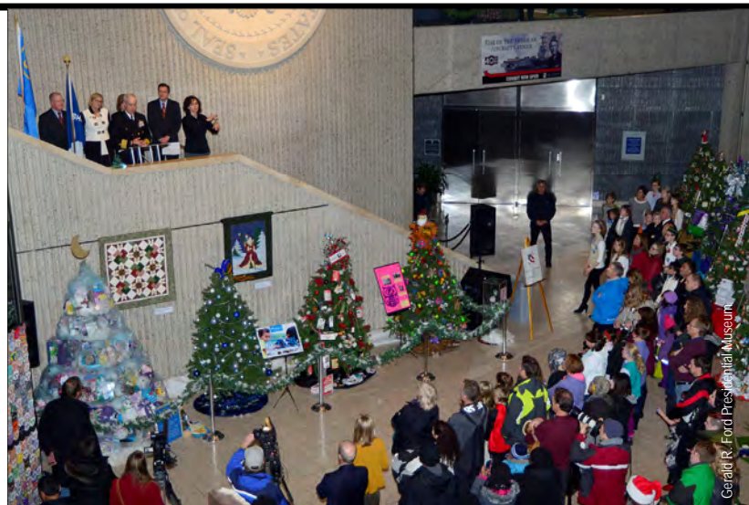
Gerald R. Ford Presidential Museum

8 Thanks to all who braved the weather to join in this year's celebration.