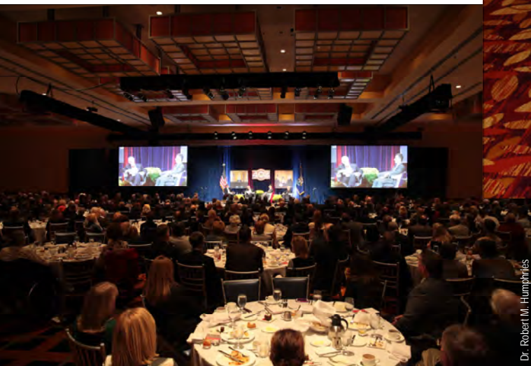
Capacity crowd at the joint Luncheon between the Gerald R. Ford Presidential Foundation and The Economic Club of Grand Rapids.