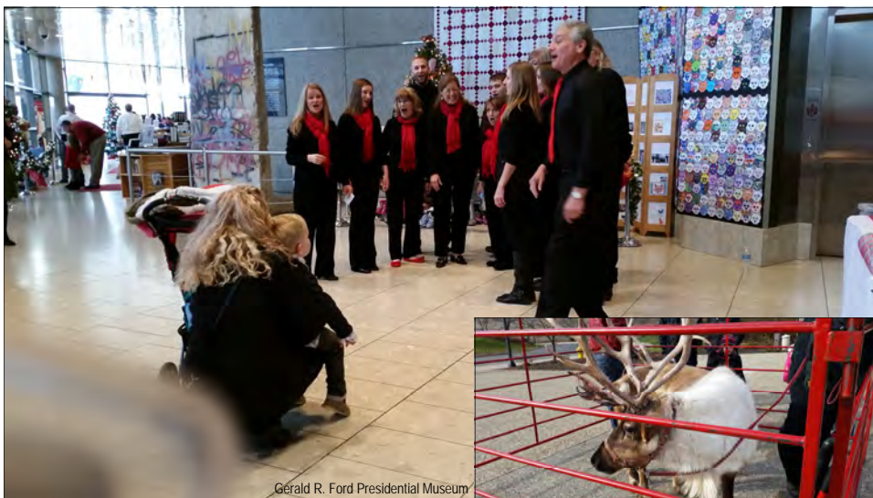
Gerald R. Ford Presidential Museum

The Museum swung open its doors the afternoon of December 7 for their annual Holiday Open House. Nearly 800 visitors were able to pet Santa's reindeer, listen to holiday music by area choirs, enjoy the Christmas on the Grand trees and Museum exhibits, and nibble on Christmas cookies, while young ones visited with Santa and Mrs. Claus. We hear from many families each year that the Open House and visit with St. Nick have become an annual tradition for them.