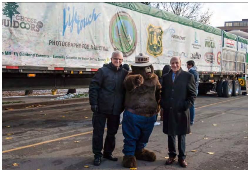
Gerald R. Ford Presidential Museum