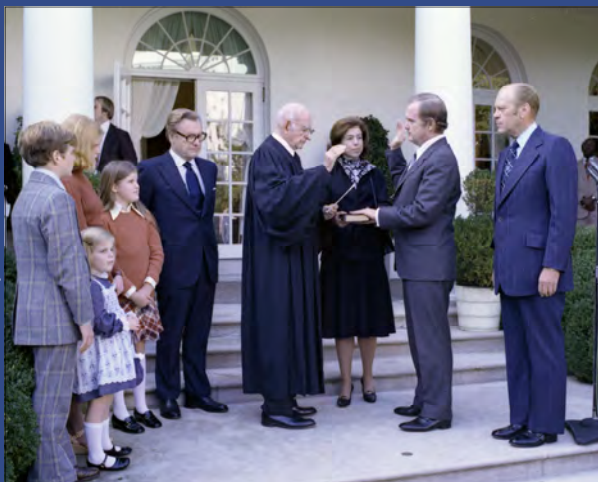
Photo taken during the Swearing-In Ceremony for SEC Chairman Roderick M. Hills outside the White House on October 28, 1975. (l-r) Children of Roderick and Carla Hills; Vice President Nelson Rockefeller, retired U.S. Supreme Court Justice Stanley Reed, the Honorable Carla Hills, SEC Chairman Roderick M. Hills and President Gerald R. Ford. Mr. Hills served as law clerk to Justice Reed from 1955 to 1957.

Our sincere condolences to the Hills family.