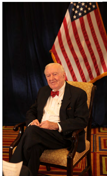
Justice John Paul Stevens.