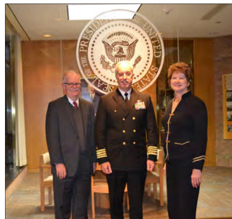
Gerald R. Ford Presidential Library