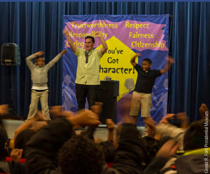
Gerald R. Ford Presidential Museum