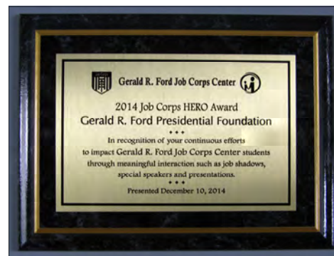
Gerald R. Ford Presidential Museum

The Foundation has been recognized by the Gerald R. Ford Job Corps Center in Grand Rapids with the 2014 Job Corps HERO Award. This was in recognition of our efforts to support the Center's students through ongoing initiatives and interactions. We are thrilled to receive this award as the Foundation continues to support the Center's young adults.