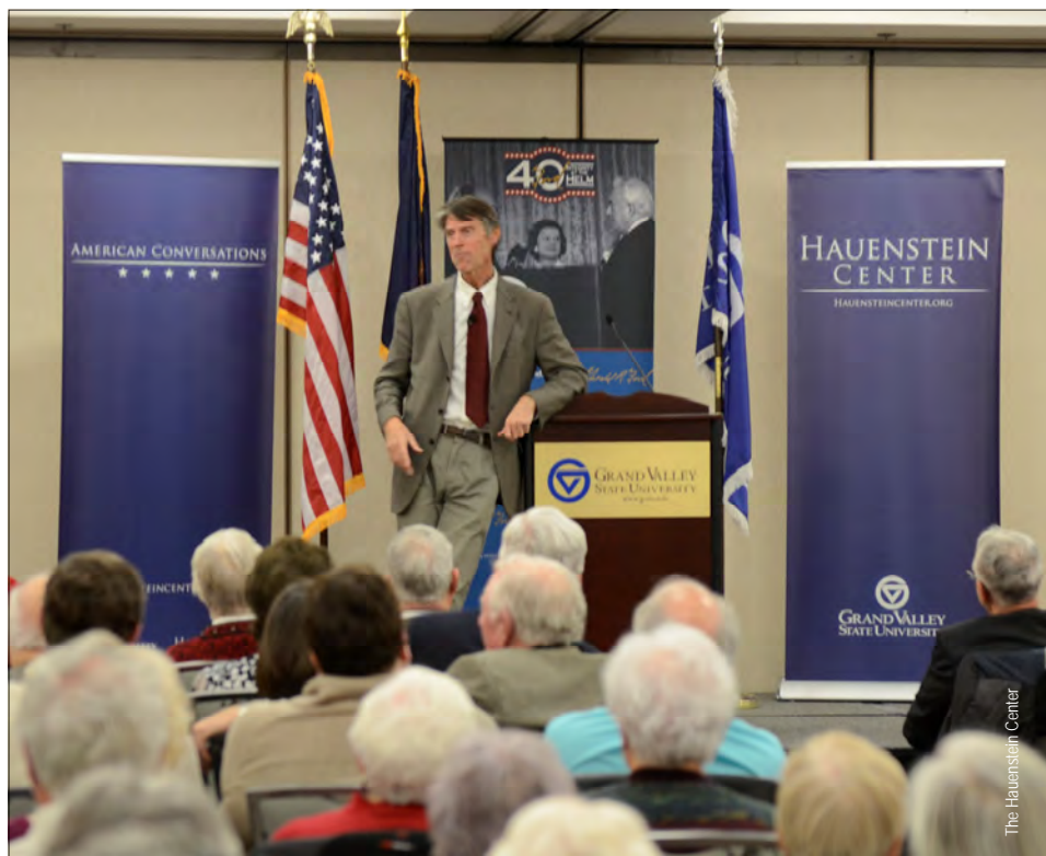
The Hauenstein Center