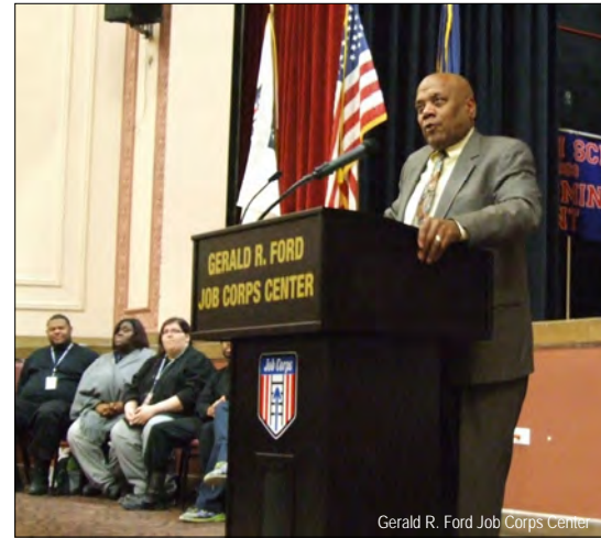
Gerald R. Ford Job Corps Center