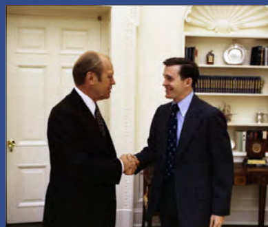
Gerald R. Ford Presidential Library

President Gerald R. Ford and Special Assistant to the President, Roger B. Porter. Photo taken in Oval Office on December 10, 1976.