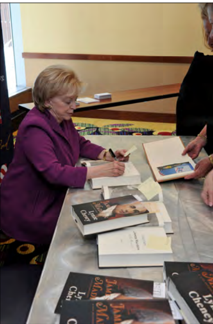
Lynne Cheney autographed copies of her book following the luncheon.