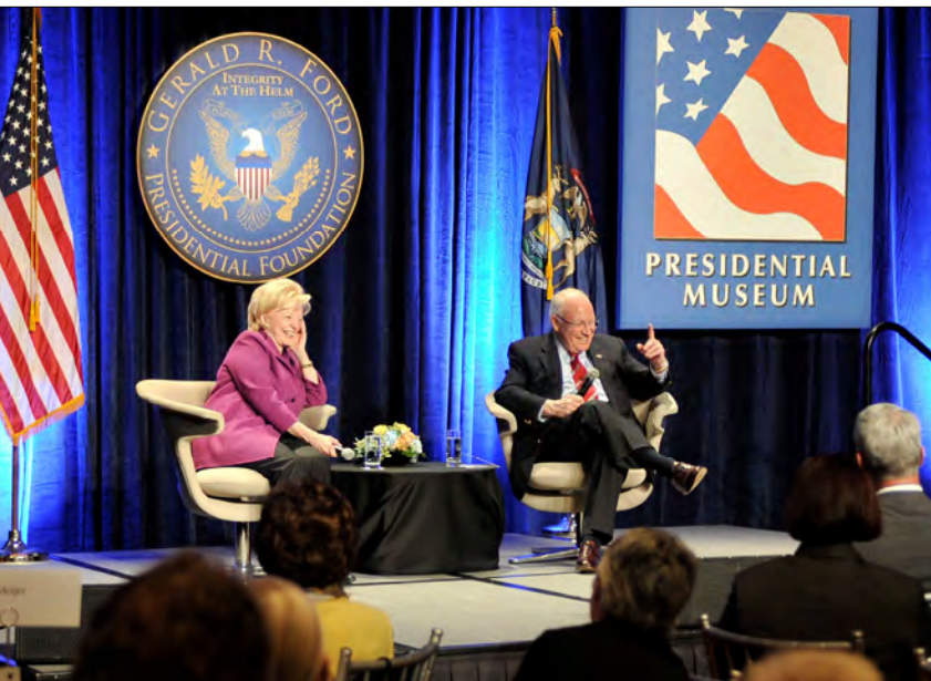
Dr. Lynne Cheney and Vice President Dick Cheney on stage during the First Ladies luncheon.

"What a pleasure it is to be here today and to honor Betty Ford. She once said 'Anybody can be First Lady, anybody can do these things. Look it's happened, I'm anybody and I am here doing it' She wasn't just anybody...she was a woman of so much character and integrity and I feel very lucky to have had her be a model for me and for so many others".