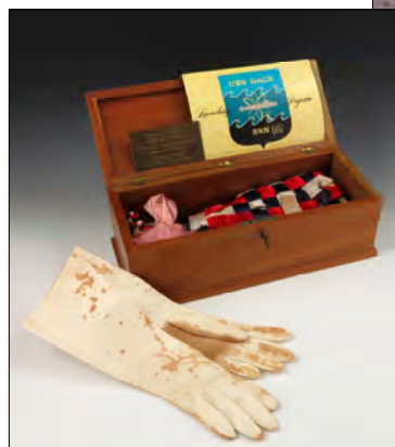
Gerald R. Ford Presidential Museum

Left: This white potholder with a red and white checkered border and text that reads "Vote for Congressman Jerry Ford Who Works for You in Congress" is one of many to grace the Museum's artifact collections. Ford gave them to constituents during his later congressional campaigns. Someone noted in 1973, during his Vice Presidency, "if Jerry Ford gets to be President, it (the potholder) will be a snappy item for the national archives." The same newspaper article that printed the comment also pointed out that Congressman Ford "would help a boy who wanted to go to West Point, and do what he could when a voter was in trouble, he also helped get casseroles in the oven."