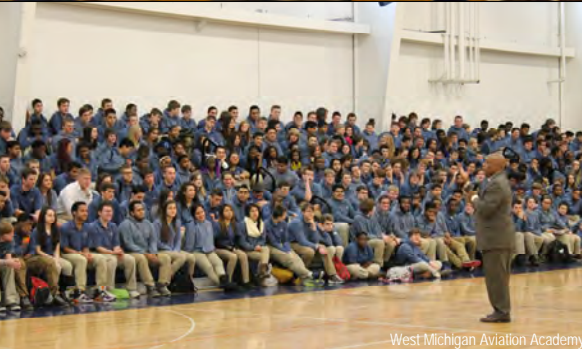
West Michigan Aviation Academy