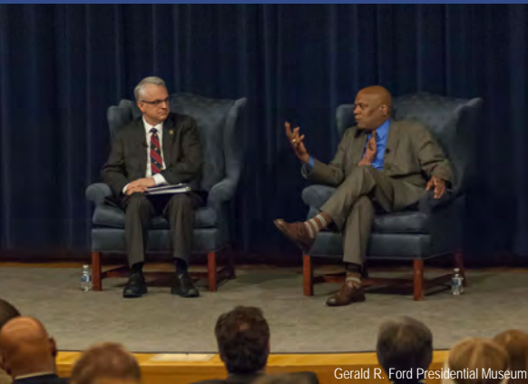
Gerald R. Ford Presidential Museum