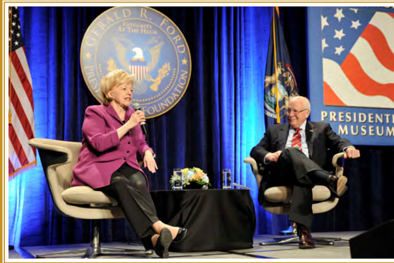
Dr. Lynne Cheney and Vice President Dick Cheney at the First Ladies Luncheon.