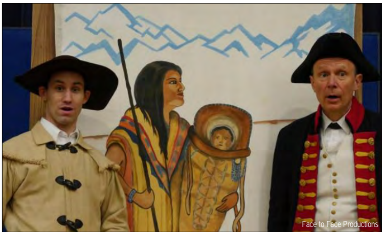
The Amazing Adventures of Lewis and Clark performers.