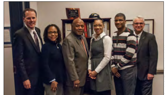
Gerald R. Ford Presidential Museum

The Foundation and Museum staff have been working on the development of a Grand Rapids tour map of President Ford's life. "Map N Tour" will provide