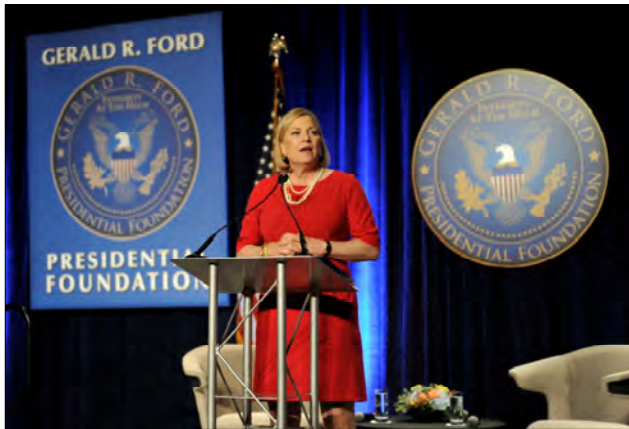
Trustee Susan Ford Bales introduced the Cheneys at the luncheon.