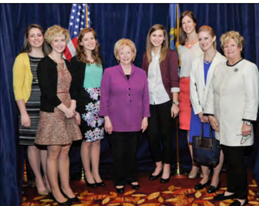
Lynne Cheney (center) meets with students and faculty from Hillsdale College following the luncheon.