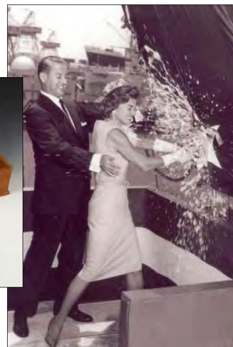
Betty Ford christens USS Dace (SSN 607) nuclear submarine, August 18, 1962. (U.S. Navy photo)