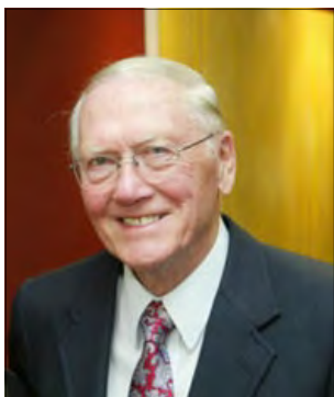
Robert P. Griffin

Our sincere condolences to the family of former U.S. Senator, Robert P. Griffin who passed away Thursday, April 16, 2015. Senator Griffin was first elected to the Gerald R. Ford Presidential Foundation's Board of Trustees in September 1981 and served as Honorary Trustee since July 2013. He served as Board Chairman from 1981-85.