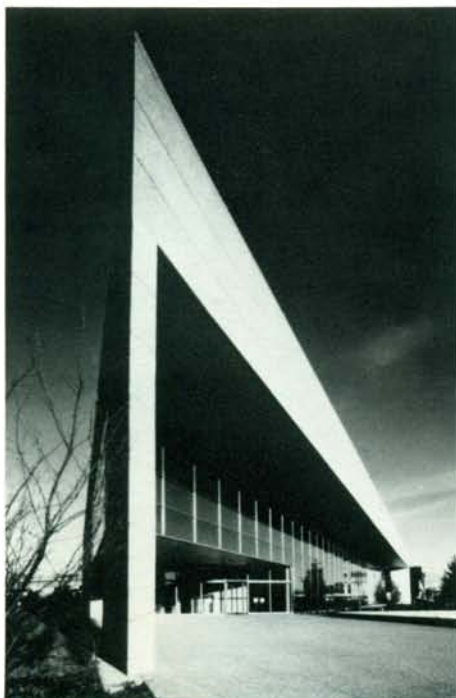
Gerald R. Ford Museum, Grand Rapids, Michigan.