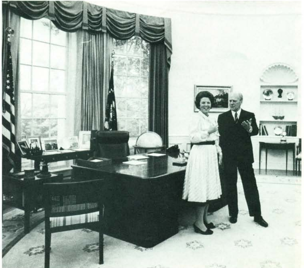
Here, Queen Beatrix of The Netherlands meets with President Ford in the Museum's full-scale replica of the Oval Office.

Attendance for the first year will fall within the original projection of 375,000 — 425,000 visitors. Over 25,000 of these visitors came to the museum in organized school and scout groups.