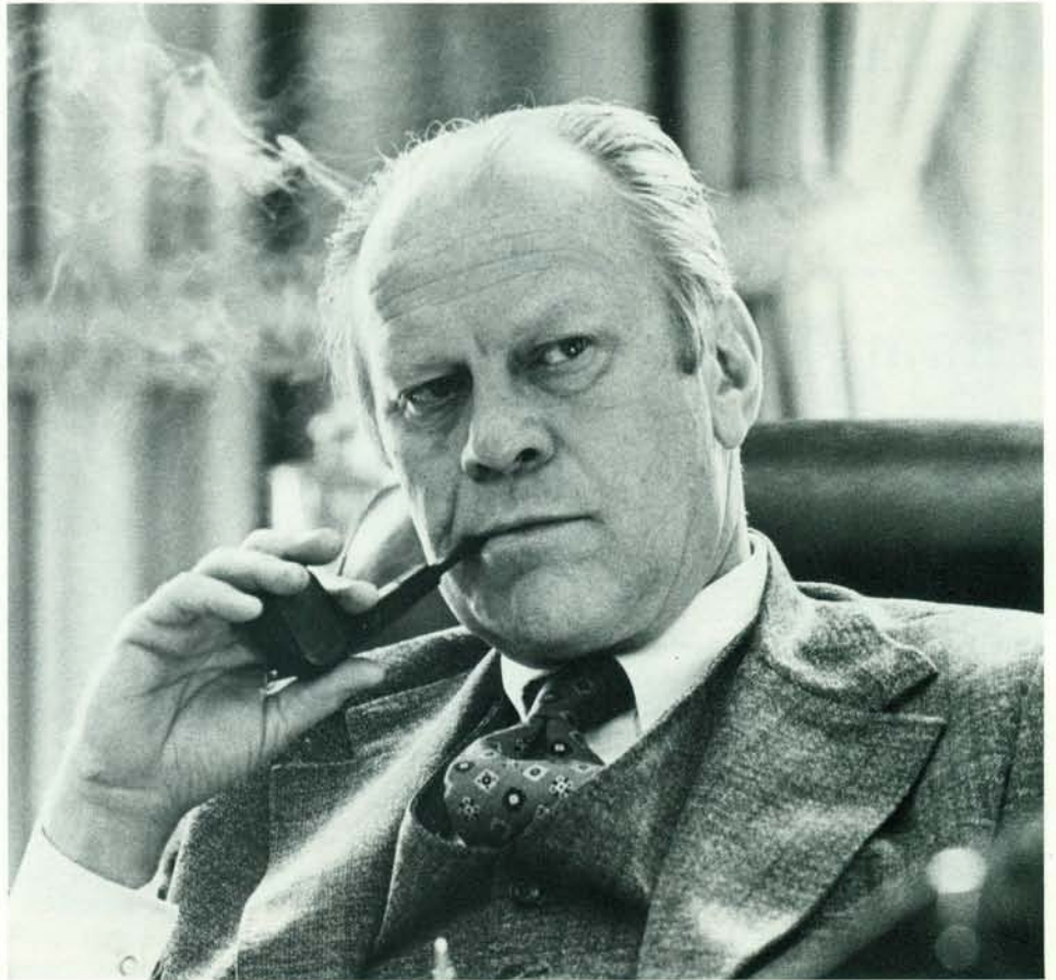
President Gerald R. Ford

In this time of shrinking government resources the role of the voluntary association has become pivotal in maintaining the quality of our cultural activities. With your help I am confident the Foundation will meet the challenge.