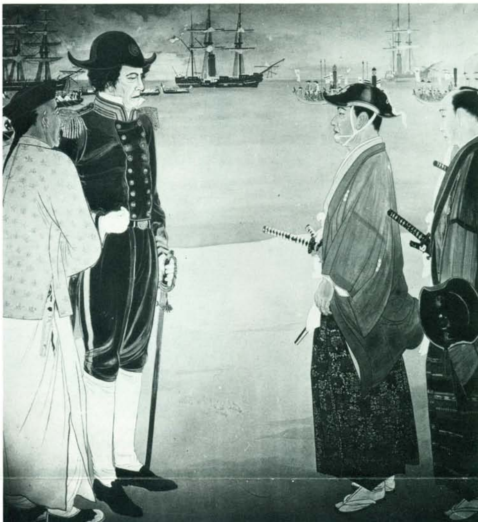
Commodore Perry meets Japanese representatives.

The Library's exhibit gallery is open from 9 a.m. to 5 p.m., Monday thru Friday, national holidays excepted. Group tours of the building may be arranged by calling (313) 668-2218.