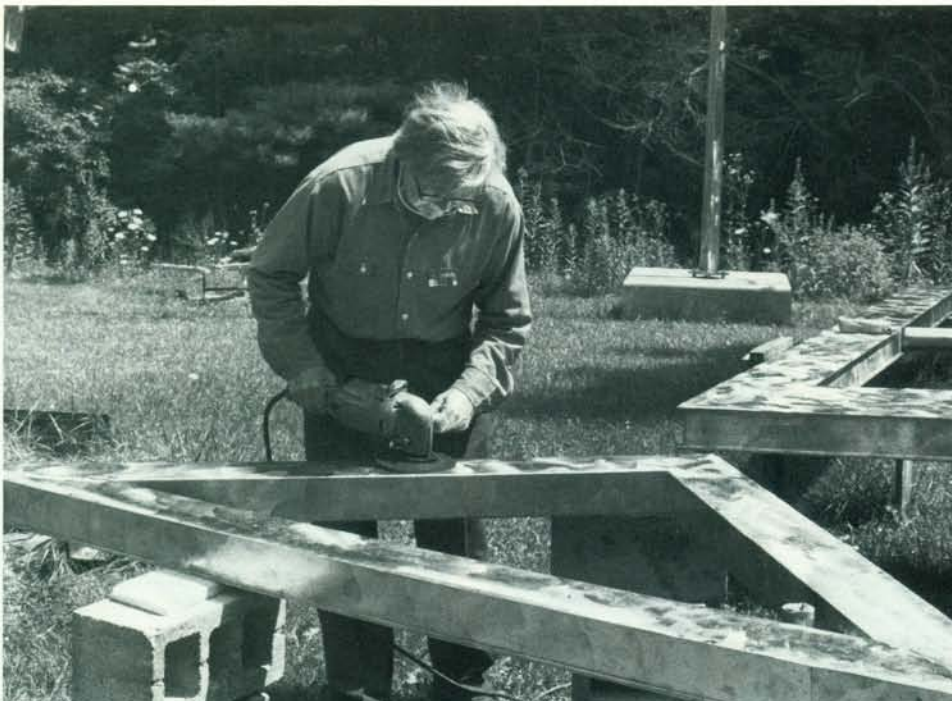
Sculptor George Rickey at work on Library sculpture.