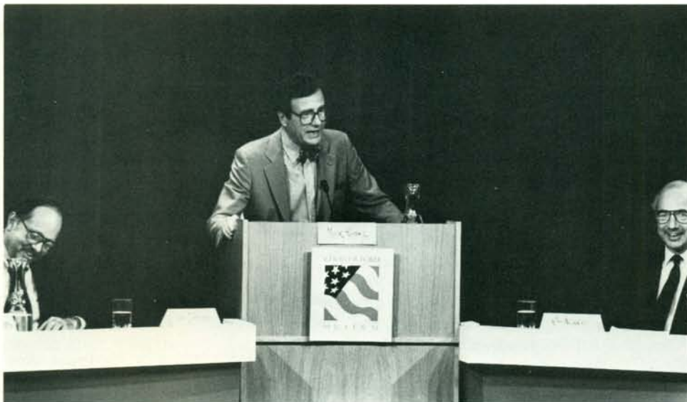
Mark Russell with Lou Cannon and Ron Nessen

"I would like to see similar symposium year at the Jimmy Carter Library — the Amoco station." Mark Russell