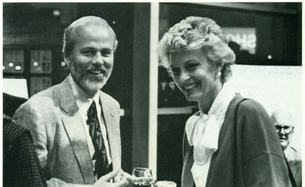
David Kennerly and Susan Ford Vance

"I've been asked why do I trade it for humanitarian reasons, limousines, and the girls? Thank you." Pat Paulsen