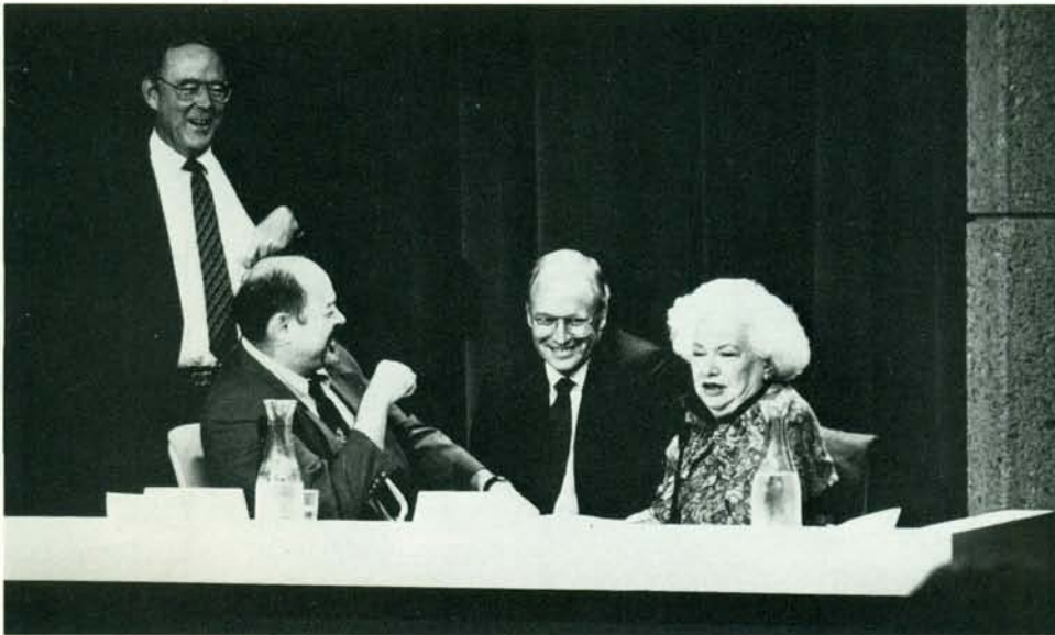
Charles Manatt, Lyn Nofziger, Dick Cheney, Liz Carpenter