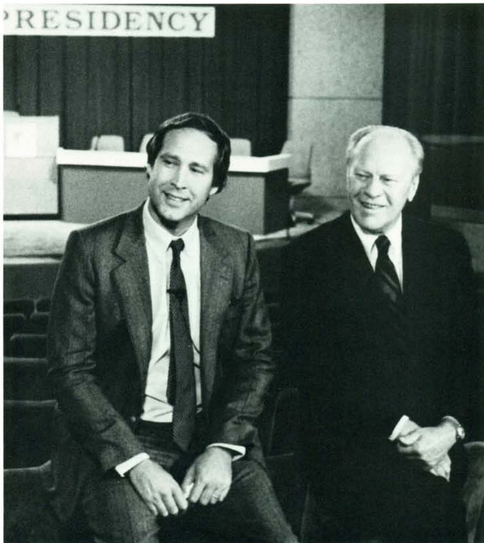
Chevy Chase and President Ford

The first afternoon session, " The Cartoonists: What Would They Do Without the Presidency? ", brought together seven of the nation's best known car-