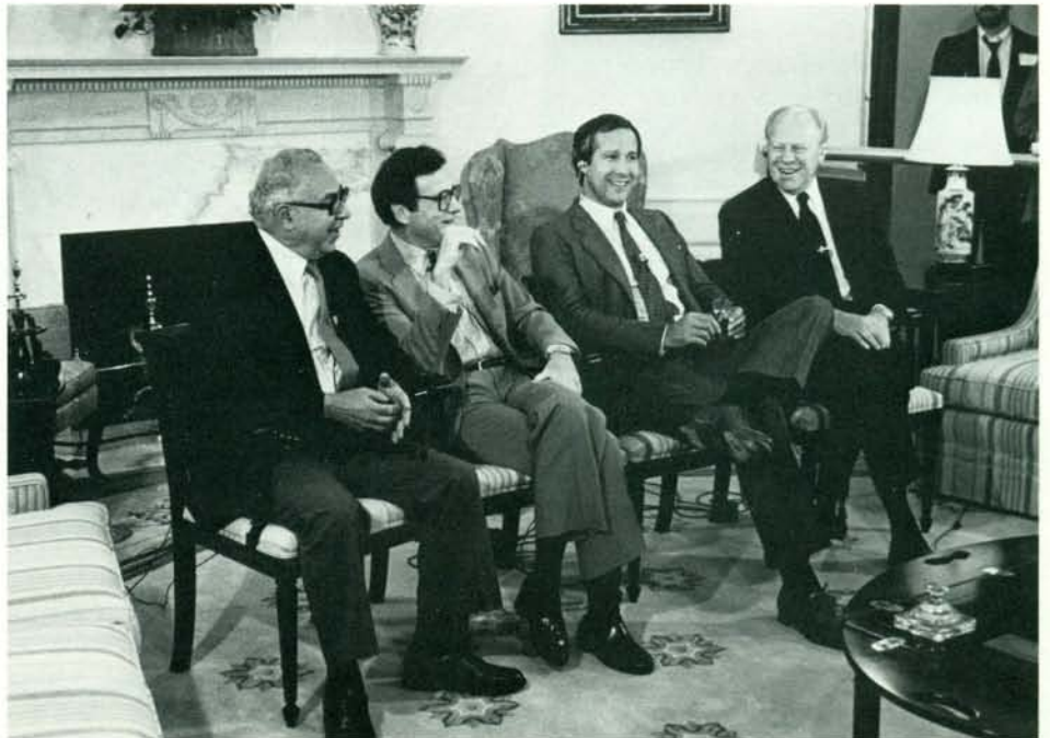
Art Buchwald, Mark Russell, Chevy Chase, and the President on Good Morning America.

Art Buchwald with cartoonists Jeff MacNelly, Berke Breathed, and Draper Hill.