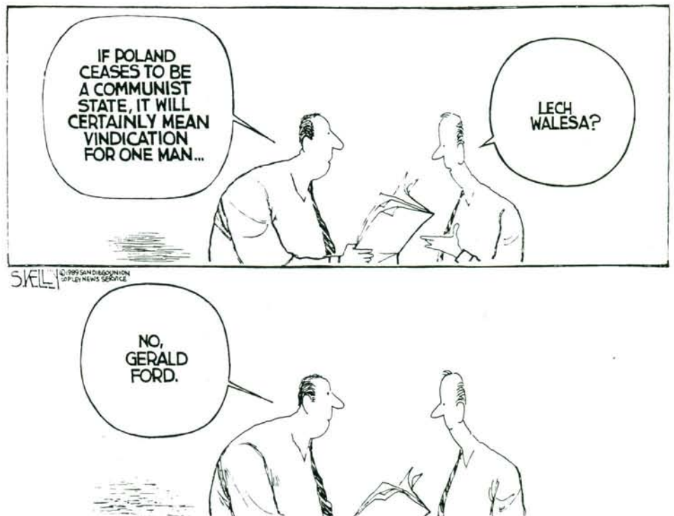
Cartoon by Steve Kelley, San Diego Union. (Used with permission)

did not symbolize an American abandoning the hopes and aspirations of the captive nations, as many pundits and some former governors charged at the time. Rather, I acted for 200 million Americans by countersigning the Eastern Europeans' own initial and cautious declarations of independence, with formal Soviet concurrence."