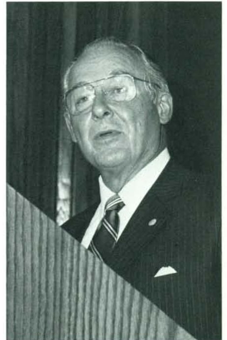
Representative Robert Michel.

FRITZ: "I think government . . . is divided because the people want it that way. Americans are naturally suspicious of too much government, and they see divided government as a kind of safeguard."