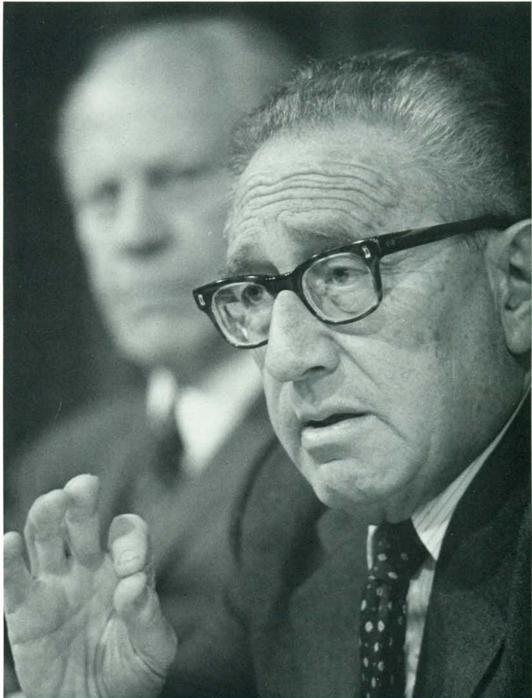
Henry Kissinger and Gerald Ford at a press conference in Grand Rapids.