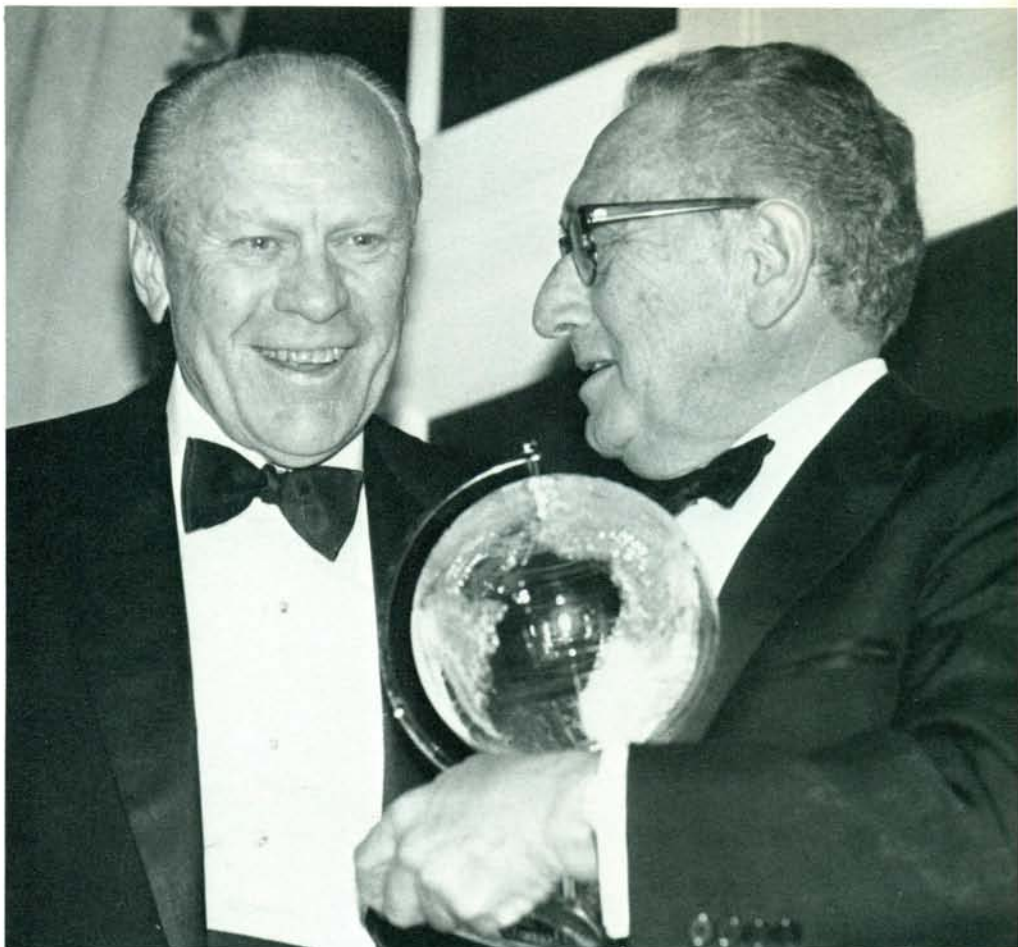
President Ford presents a crystal globe to Henry Kissinger as a token of appreciation from the Gerald R. Ford Foundation.

"We are in a position to work on building a structure of peace in the world . . ."