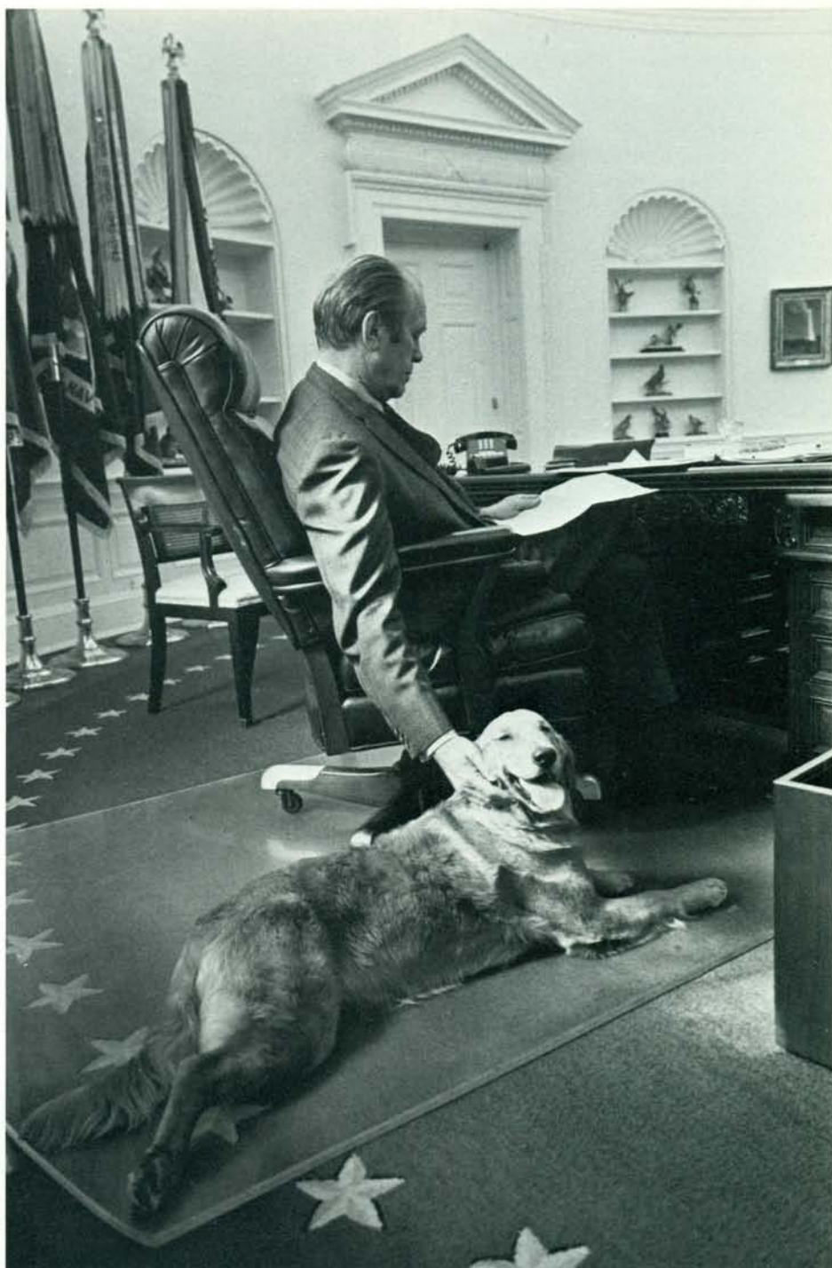
President Ford and his golden retriever, Liberty.

The exhibit will also present a number of special one-day events, including a community pet show on opening day.