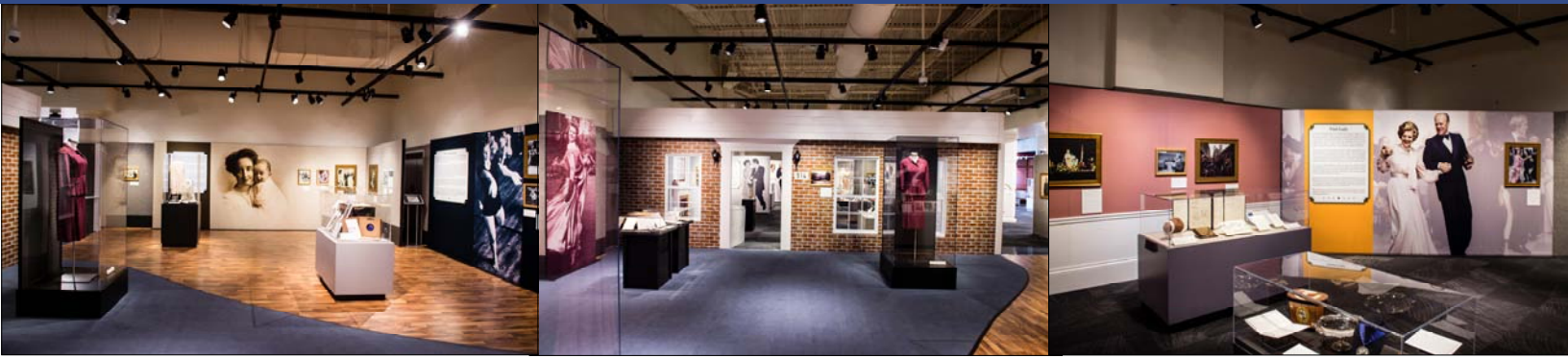
Photos from inside the Betty Ford Centennial Exhibit: "In Step With Betty Ford" at the Gerald R. Ford Presidential Museum. Exhibit will be on display through January 6, 2019.