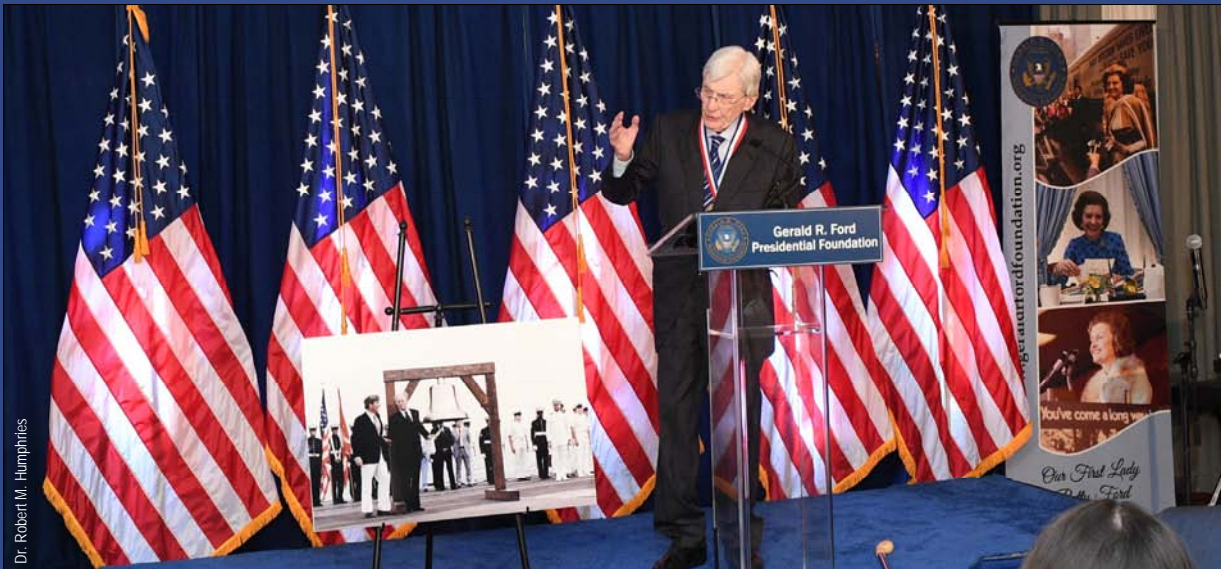
On June 4, 2018 Senator John W. Warner was awarded the 2018 Gerald R. Ford Medal for Distinguished Public Service at the Capitol Hill Club in Washington, D.C. Senator Warner was sworn in by Vice President Gerald R. Ford to be the Director of the American Bicentennial Administration on April 11, 1974 and joined President Ford on the flight deck of the USS Forrestal to initiate the ringing of the Bicentennial Bells across the nation on July 4, 1976. John Warner served as the U.S. Senator from Virginia from 1979—2009, which made him that state's longest serving Senator in history. He also served five years as Under Secretary, and later as Secretary of the United States Navy.