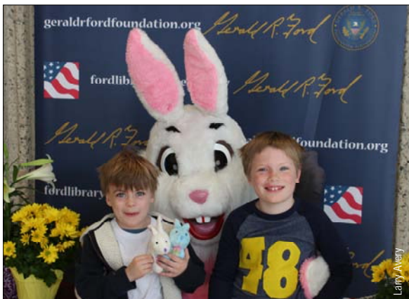
The Easter Bunny visited the Museum to the delight of all!

Grand Rapids: On March 24th, 2018, the Gerald R. Ford Presidential Museum was filled with families for the second annual Historical Betty Ford Easter Egg-Stravaganza . Young children toured the Museum with their families by visiting eight special stations throughout the exhibits. At each station, children participated in an educational activity or game and, of course, received a colorful, fun-filled Easter egg. From tossing a football with a maize and blue-clad football player to learning to “dance like Betty” from professional dancers, children and adults alike came away with a better understanding of President and Mrs. Ford, and had fun, too! After hopping along the bunny trail through the exhibits, children were treated to lemonade and cookies, as well as a visit with the Easter Bunny himself. Many thanks to Reverence and Hearts In-Step Dance Academies as well as our many volunteers who worked to make this event a memorable one for the many families that attended!