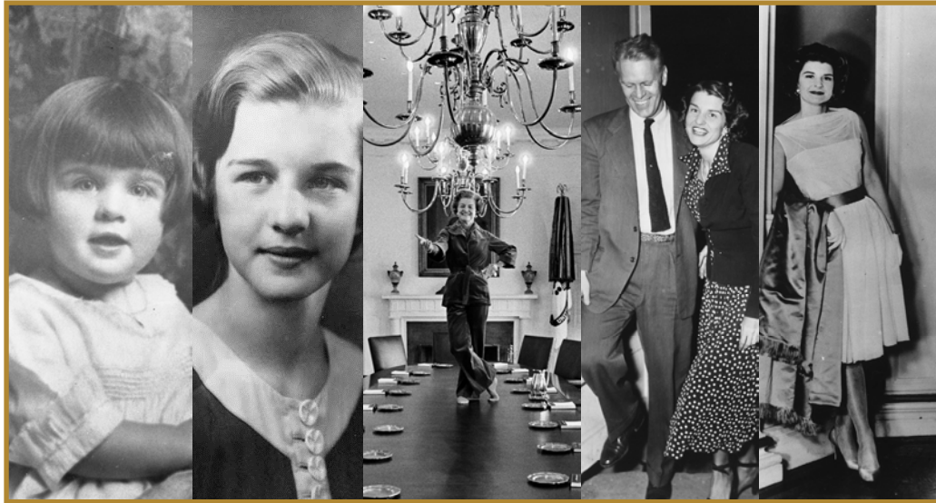
Photos Left to Right: (1) Elizabeth Anne "Betty" Bloomer, age 3, April 1921 (2) Betty at age 14, in 1932. (3) First Lady Betty Ford dances on the Cabinet Room table on the day before departing the White House upon the inauguration of President Jimmy Carter, January 19, 1977. (4) Gerald Ford and Betty in 1948. (5) Betty Ford poses for an article in Ladies Home Journal in 1962.