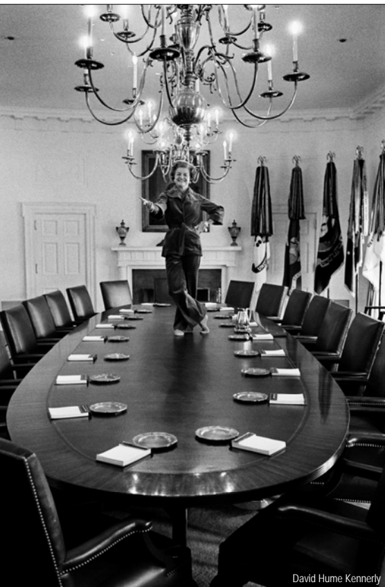
David Hume Kennerly

In 1994, former White House photographer David Hume Kennerly asked former First Lady Betty Ford if he could publish a photo he had taken on her last day in the White House. In the photo, Ford was posed atop the Cabinet Room table. As Kennerly recalls in a 2008 Smithsonian Magazine article, President Gerald R. Ford hadn't seen the photo, and was surprised when he did.