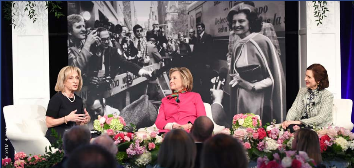
"America's First Ladies: The Centennial Birthday of First Lady Betty Ford" luncheon was held on April 11, 2018 at the Frederik Meijer Gardens & Sculpture Park in Grand Rapids, Michigan. This year's special guests were former First Lady and Secretary Hillary Rodham Clinton; Lynda Bird Johnson Robb (right), daughter of Lyndon and Lady Bird Johnson; and NBC Journalist Andrea Mitchell (left).