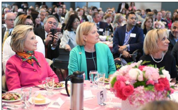
(l-r) Secretary Hillary Clinton, Susan Ford Bales, and Andrea Mitchell.