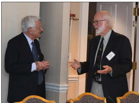
(l-r) Trustees Frank Zarb and David Hume Kennerly.