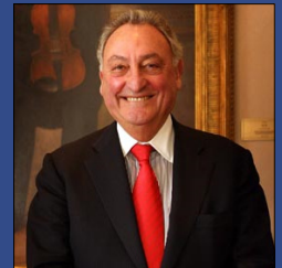
Sanford Weill 2010-2018