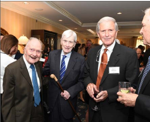
Trustee Brent Scowcroft, Senator John Warner, Trustee David Mathews