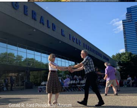
Gerald R. Ford Presidential Museum