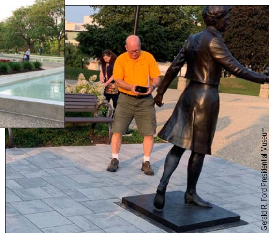
Gerald R. Ford Presidential Museum