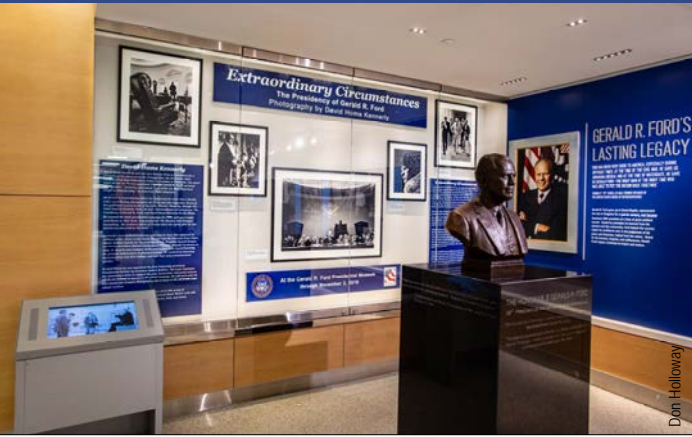
Renovated exhibit at the Gerald R. Ford International Airport.