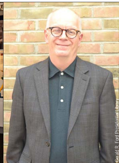
Gerald R. Ford Presidential Library