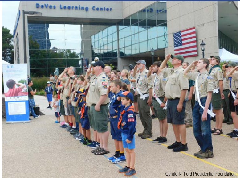
Scouts salute the flag on 9-11 at the Museum.