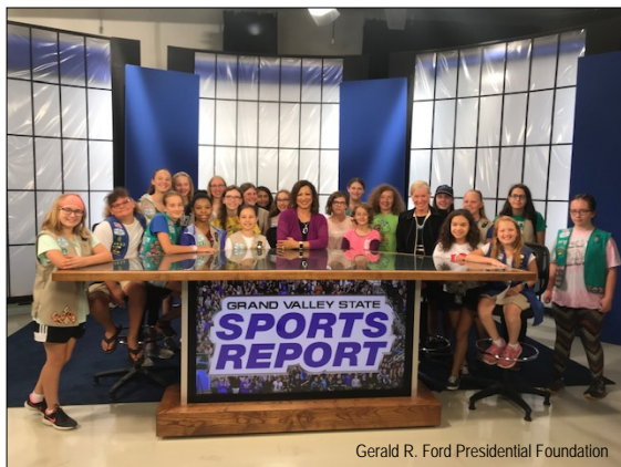
Camp participants during "backstage" tour of the WGVU studios.

This summer our education team provided a number of different camps for Scouts.