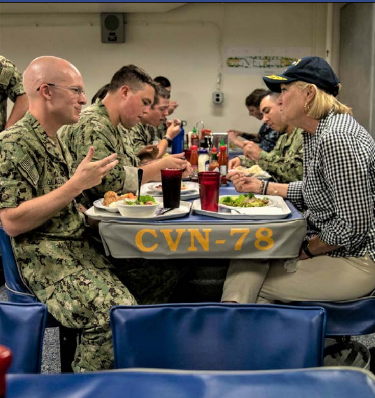
Susan Ford Bales enjoying lunch with sailors in the ship's aft mess.