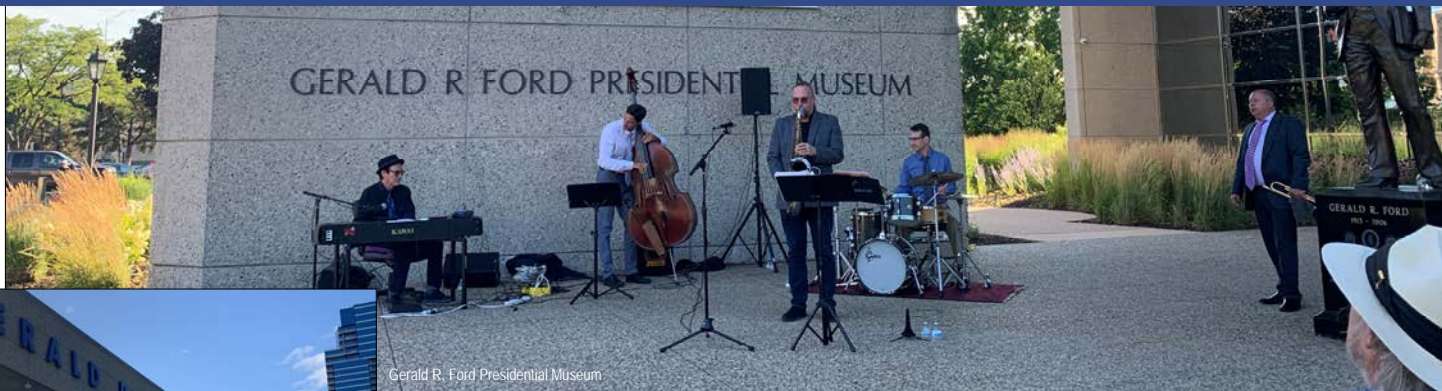
Gerald R. Ford Presidential Museum