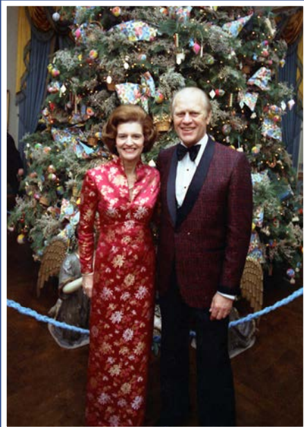
President and Mrs. Ford's First Christmas in the White House, 1974.

from the Trustees and Staff of the Gerald R. Ford Presidential Foundation