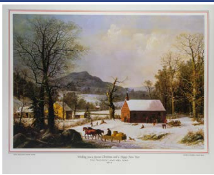
1974 Hallmark reproduction of George Henry Durrie's painting New England Snow Scene .

Gerald R. Ford was sworn in as the 38th President of the United States on August 9, 1974. Having to move into the White House so suddenly and getting settled, the new First Family had very little time to prepare for their 1974 Christmas. The most recent presidents and their families took their Christmas decorations with them, so Mrs. Ford had to get the White House in order for the holiday season from start to finish. She decided on a patchwork theme, and commissioned several artisan workshops from around the nation to create ornaments for the White House Christmas tree. Because the country was in the worst economic times since the 1930s, the patchwork theme was to symbolize simplicity and financial prudence.