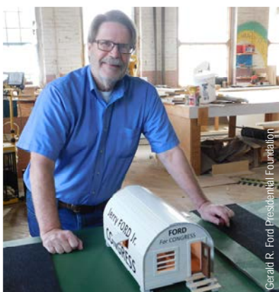
Gerald R. Ford Presidential Foundation