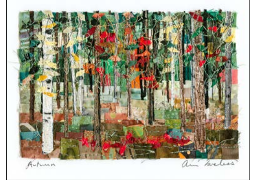
Autumn fabric mosaic landscape art quilt class project.